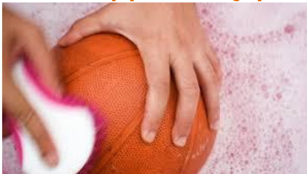
Click image above ↑

Contact our partners at Stanley Steemer for "Back to School" cleaning rates. Click image below