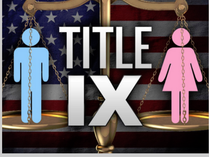
Meet SC's Title IX icons as highlighted by NFHS...