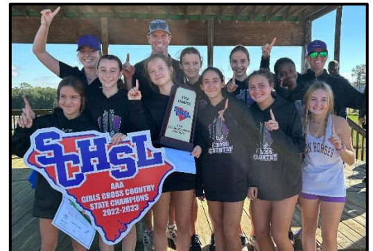
AAA: Philip Simmons High School