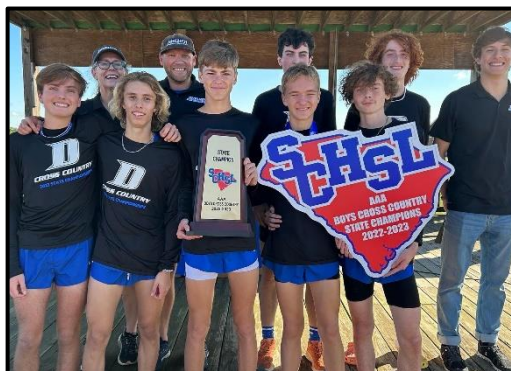
AAA: Dreher High School