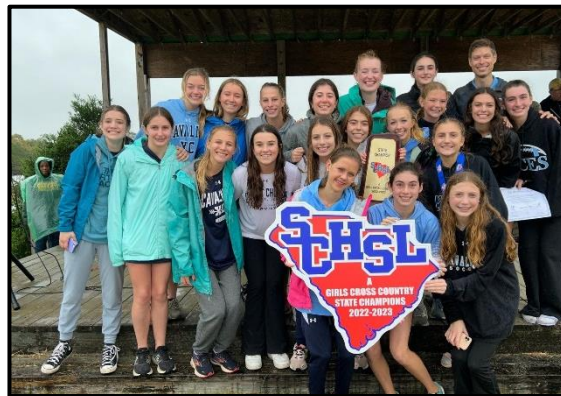
A: Christ Church Episcopal School

A: Christ Church Episcopal School; AA: Bishop England High School; AAA: Philip Simmons High School; AAAA: Greenville High School; AAAAA: Lexington High School.