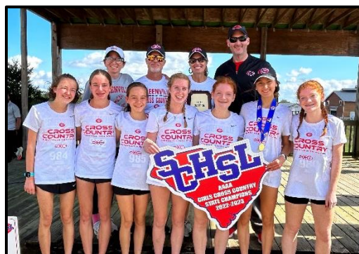
AAAA: Greenville High School