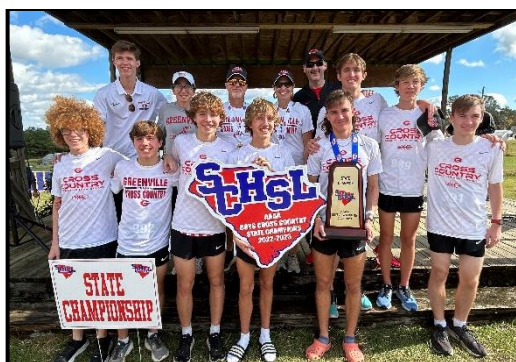
AAAA: Greenville High School