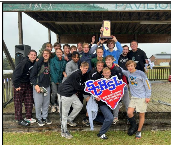
A: Brashier Middle College

A: Brashier Middle College; AA: Greer Middle College Charter High School; AAA: Dreher High School; AAAA: Greenville High School; AAAAA: Wando High School.