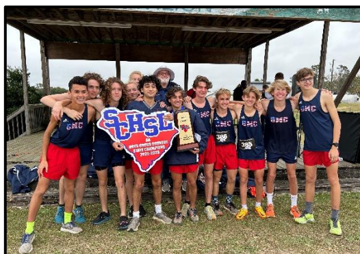
AA: Greer Middle College Charter High School