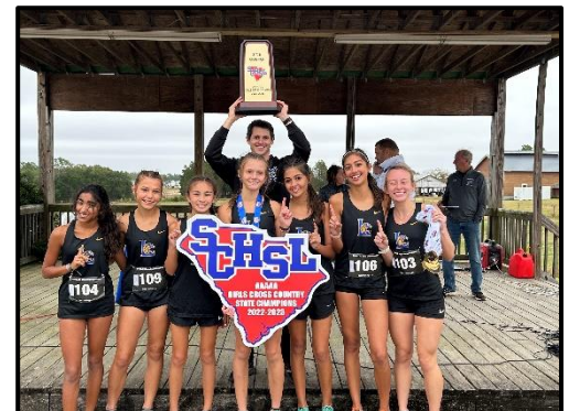
AAAAA: Lexington High School