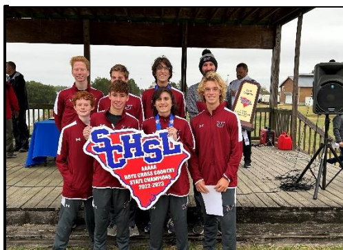
AAAAA: Wando High School