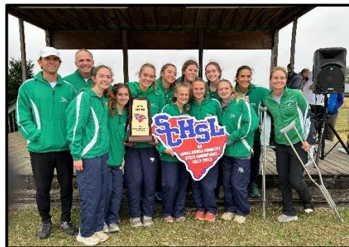
AA: Bishop England High School