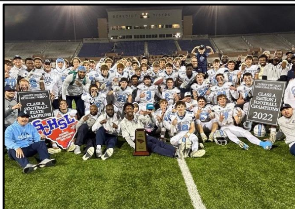
A: Christ Church Episcopal School

A: Christ Church Episcopal School; AA: Abbeville High School; AAA: Beaufort High School; AAAA: South Florence High School; AAAAA: Dutch Fork High School.