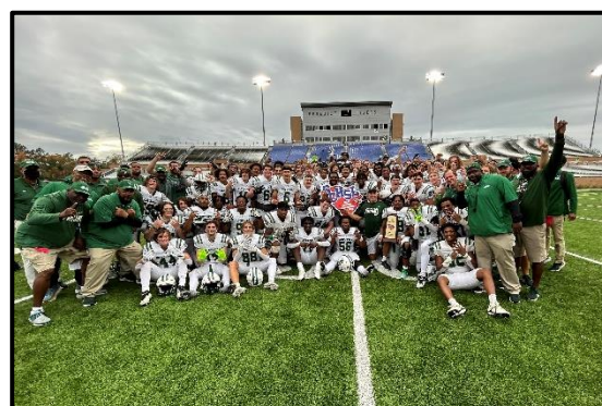
AAAAA: Dutch Fork High School