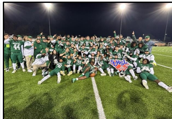
AAA: Beaufort High School