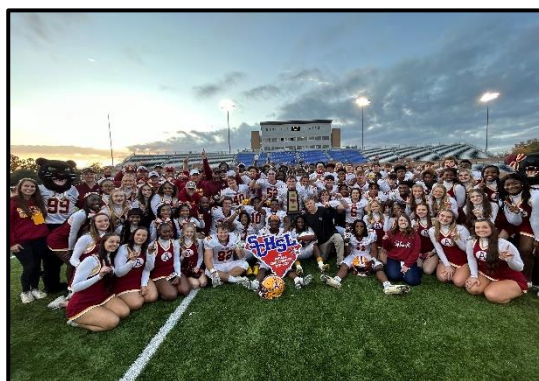
AA: Abbeville High School