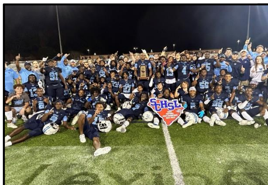
AAAA: South Florence High School