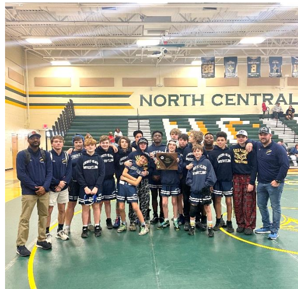
Lugoff-Elgin Middle School