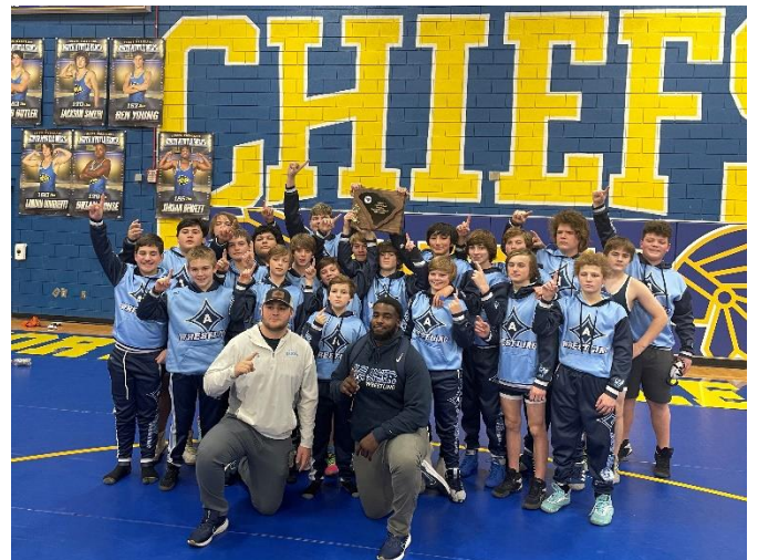
Aynor Middle School