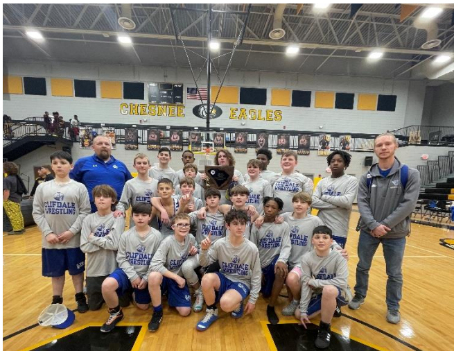
Clifdale Middle School

Clifdale Middle School were the Regional Champion at the Chesnee site, Aynor Middle School won the North Myrtle Beach Regional and Lugoff-Elgin was victorious at the North Central Site.