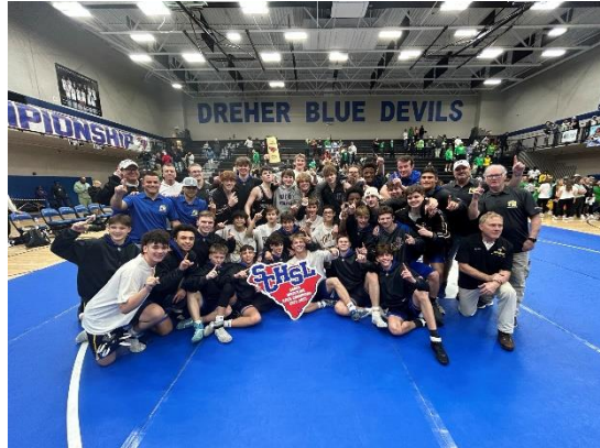
AAAAA: Fort Mill High School