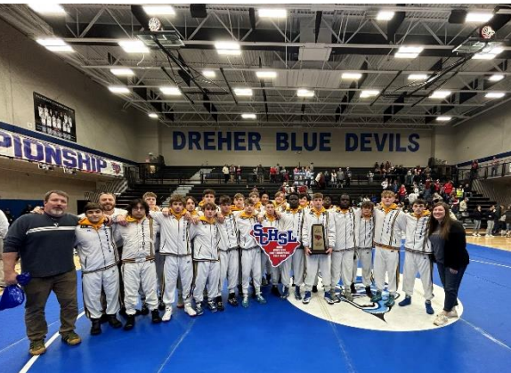
AAAA: Eastside High School