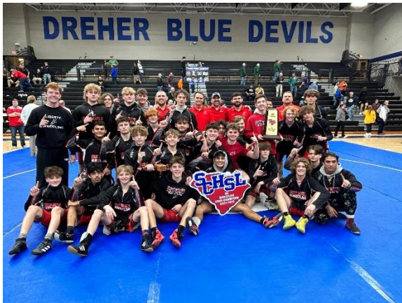
A-AA: Liberty High School

AA: Liberty High School; AAA: West-Oak High School; AAAA: Eastside High School; AAAAA: Fort Mill High School.