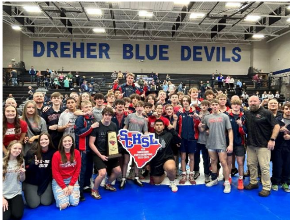
AAA: West-Oak High School