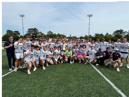
Lucy Beckham High School