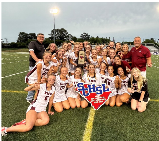
Wando High School