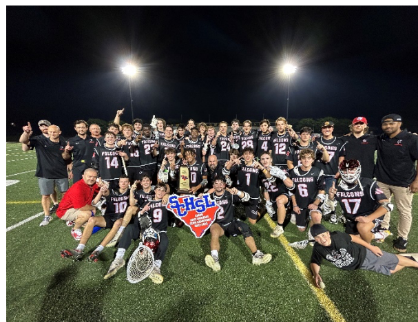
Nation Ford High School