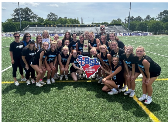
Oceanside Collegiate Academy