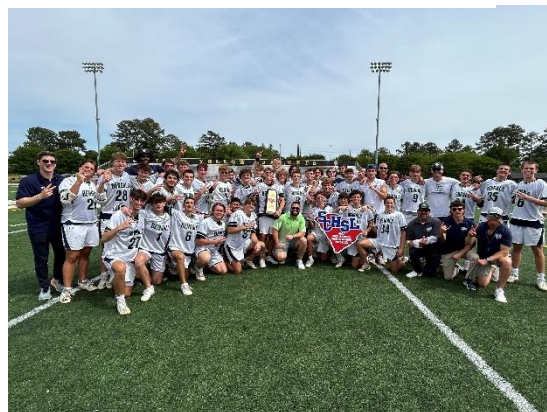
Lucy Beckham High School