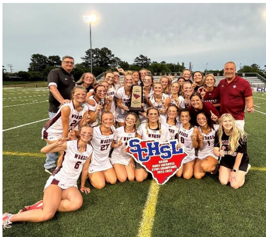
Wando High School