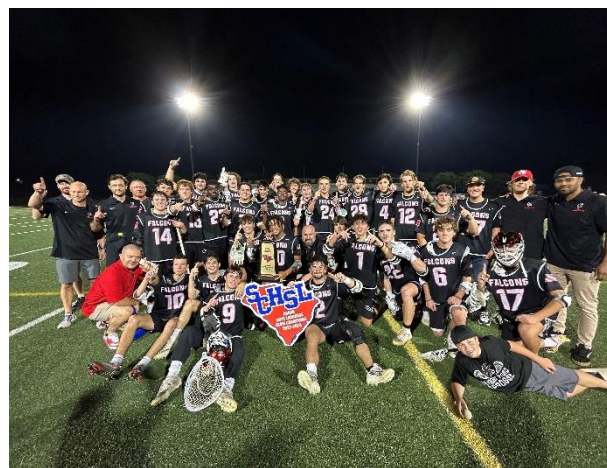
Nation Ford High School