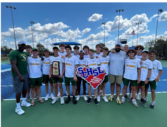
Myrtle Beach High School