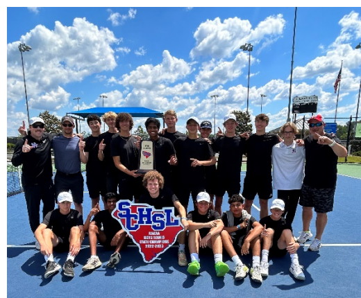
JL Mann High School