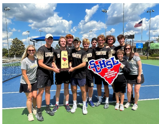
Camden High School