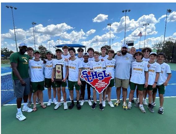
Myrtle Beach High School