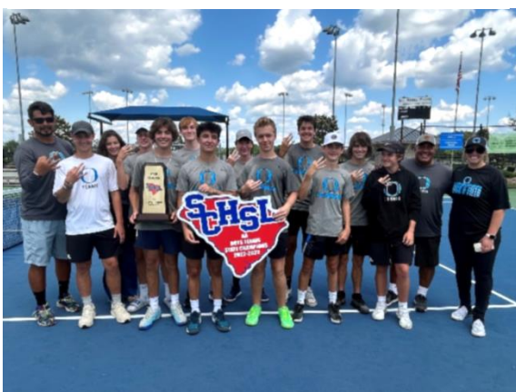
Oceanside Collegiate Academy