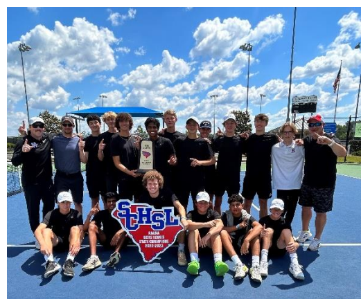
JL Mann High School