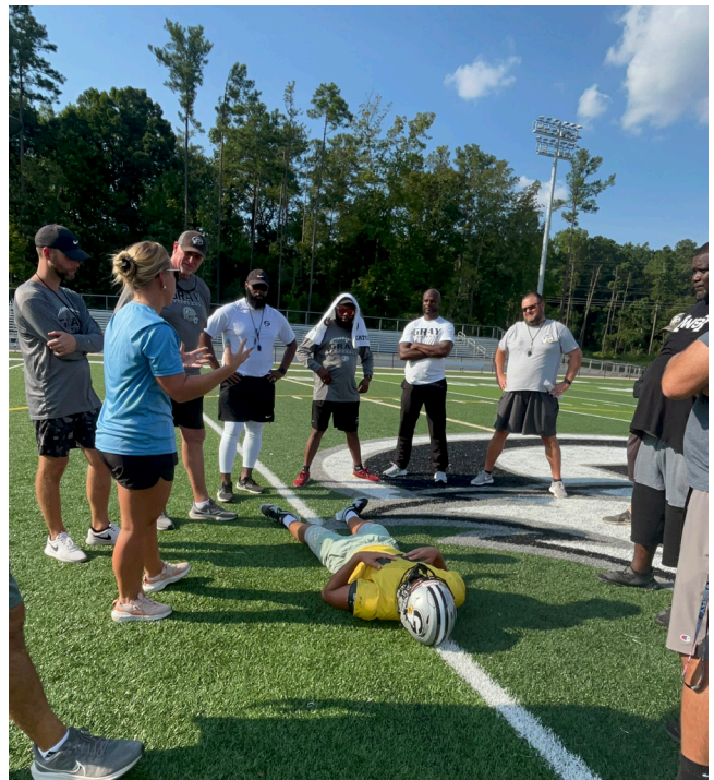
Gray Collegiate Academy