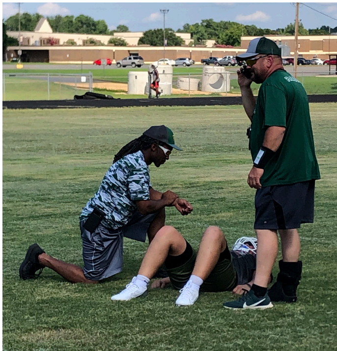
Rawlinson Road Middle School