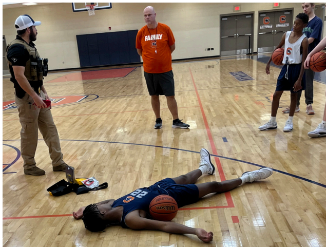
Chapman High School