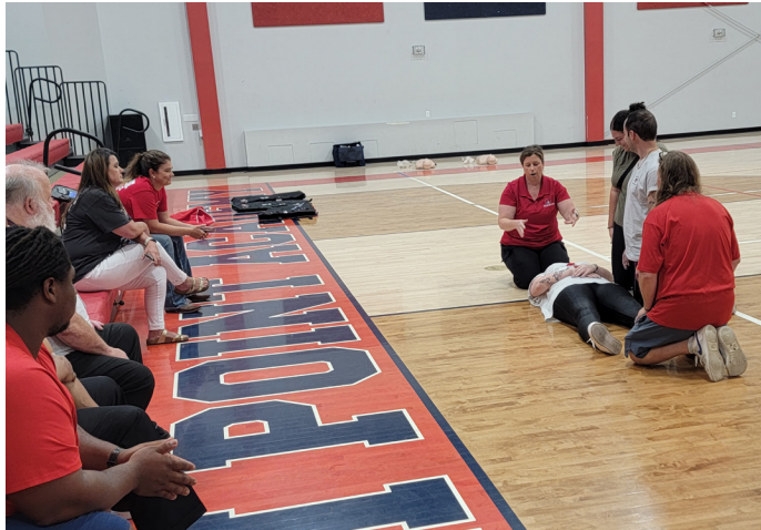
High Point Academy