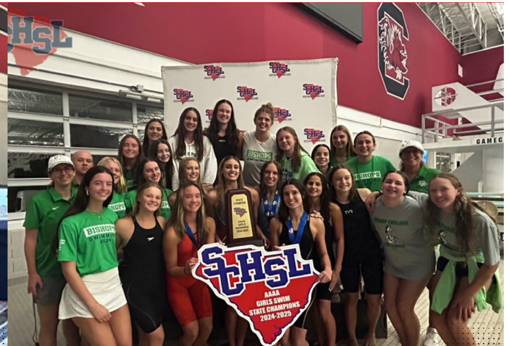
CLASS AAAA 2024 GIRLS SWIMMING STATE CHAMPIONS BISHOP ENGLAND HIGH SCHOOL