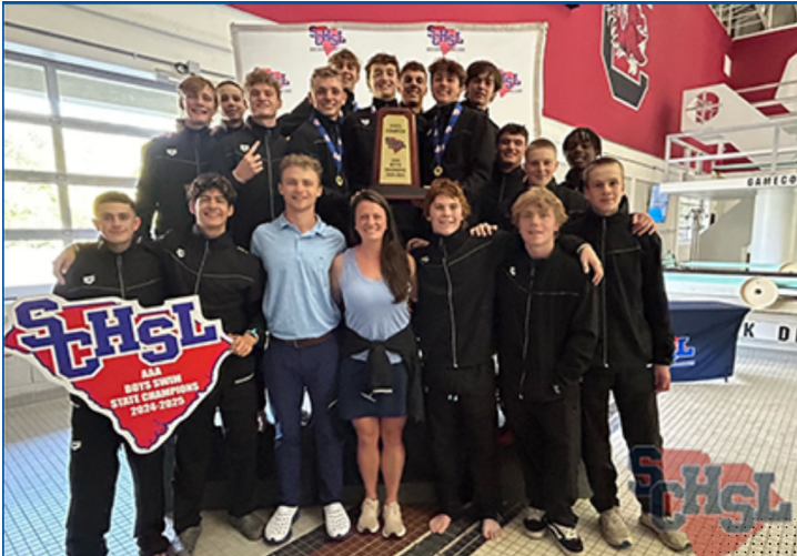
CLASS AAA 2024 BOYS SWIMMING STATE CHAMPIONS GREER MIDDLE COLLEGE CHARTER HIGH SCHOOL