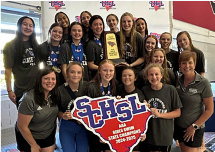
CLASS AAA 2024 GIRLS SWIMMING STATE CHAMPIONS SAINT JOSEPH'S CATHOLIC SCHOOL