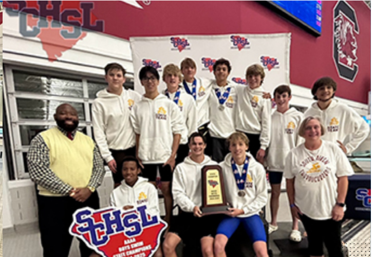
CLASS AAAA 2024 BOYS SWIMMING STATE CHAMPIONS SOUTH AIKEN HIGH SCHOOL