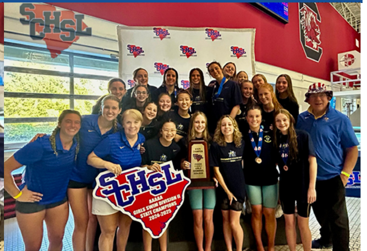
CLASS AAAAA-DIVISION 2 2024 GIRLS SWIMMING STATE CHAMPIONS FORT MILL HIGH SCHOOL