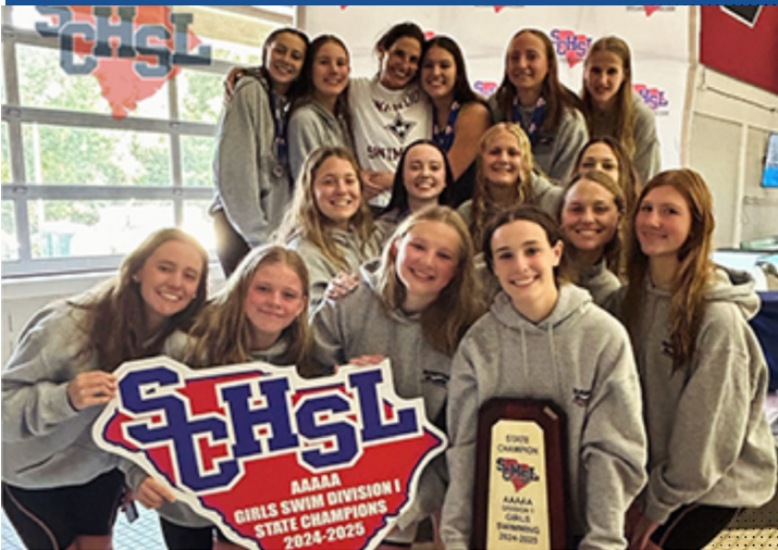
CLASS AAAAA-DIVISION 1 2024 GIRLS SWIMMING STATE CHAMPIONS WANDO HIGH SCHOOL