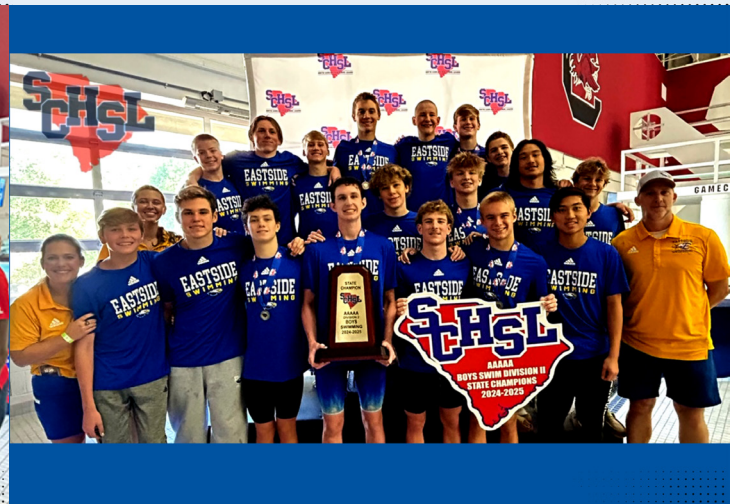
CLASS AAAAA-DIVISION 2 2024 BOYS SWIMMING STATE CHAMPIONS EASTSIDE HIGH SCHOOL