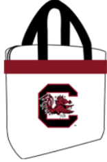
12"x 6"x 12" clear plastic bag