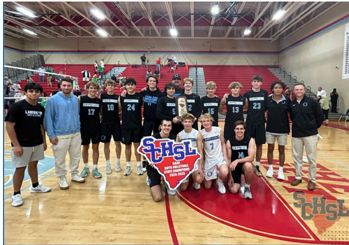
CLASS AAAA 2024 BOYS VOLLEYBALL STATE CHAMPIONS: OCEANSIDE COLLEGIATE ACADEMY