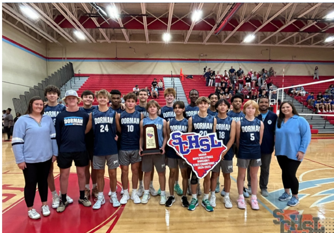
CLASS AAAAA-DIVISION 1 2024 BOYS VOLLEYBALL STATE CHAMPIONS: DORMAN HIGH SCHOOL