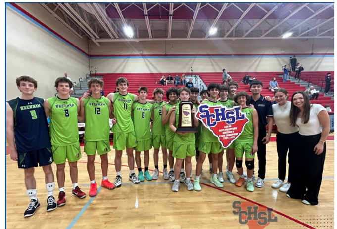
CLASS AAAAA-DIVISION 2 2024 BOYS VOLLEYBALL STATE CHAMPIONS: LUCY BECKHAM HIGH SCHOOL