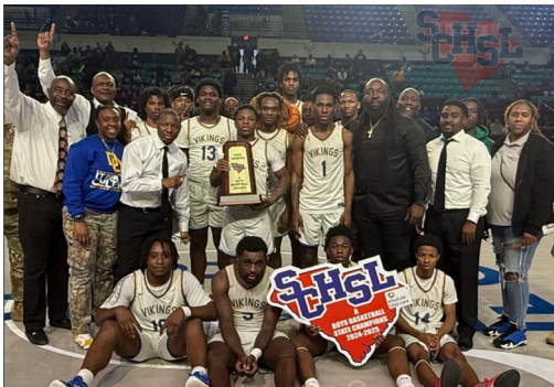
CLASS A 2025 BOYS BASKETBALL STATE CHAMPIONS