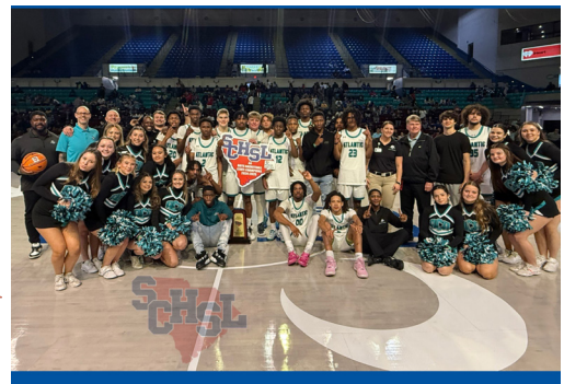
CLASS AA 2025 BOYS BASKETBALL STATE CHAMPIONS