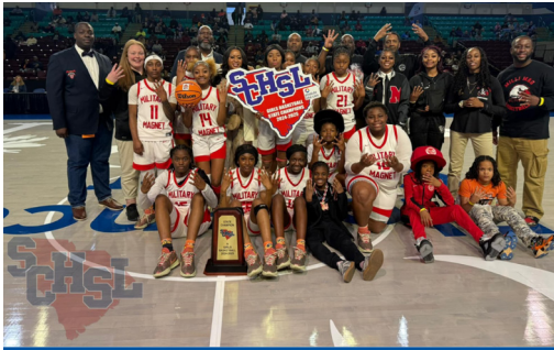
CLASS A 2025 GIRLS BASKETBALL STATE CHAMPIONS MILITARY MAGNET HIGH SCHOOL