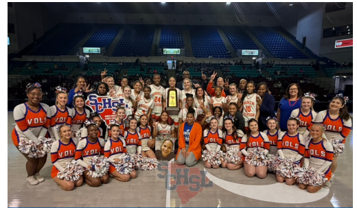
CLASS AA 2025 GIRLS BASKETBALL STATE CHAMPIONS ANDREW JACKSON HIGH SCHOOL