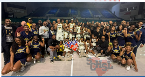
CLASS AAA 2025 BOYS BASKETBALL STATE CHAMPIONS