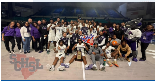
CLASS AAAAA-DIVISION 1 2025 BOYS BASKETBALL STATE CHAMPIONS