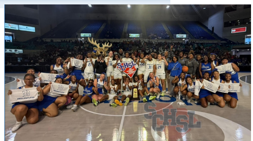
CLASS AAAAA-DIVISION 2 2025 GIRLS BASKETBALL STATE CHAMPIONS BERKELEY HIGH SCHOOL