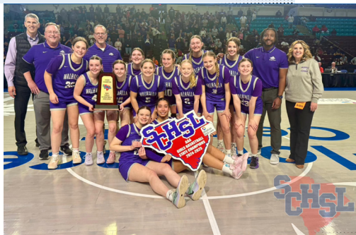
CLASS AAA 2025 GIRLS BASKETBALL STATE CHAMPIONS WALHALLA HIGH SCHOOL