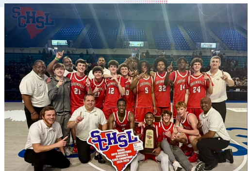
CLASS AAAAA-DIVISION 2 2025 BOYS BASKETBALL STATE CHAMPIONS