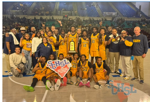
CLASS AAAA 2025 BOYS BASKETBALL STATE CHAMPIONS