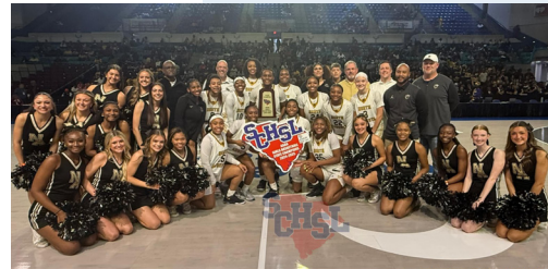
CLASS AAAA 2025 GIRLS BASKETBALL STATE CHAMPIONS NORTH AUGUSTA HIGH SCHOOL