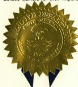
HENRY McMASTER GOVERNOR STATE OF SOUTH CAROLINA

throughout the state and encourage all South Carolinians to join together in recognizing athletic trainers for their important work in keeping the community healthy.