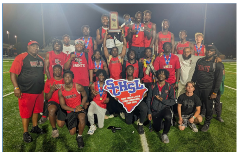
CLASS A 2025 BOYS TRACK AND FIELD STATE CHAMPIONS