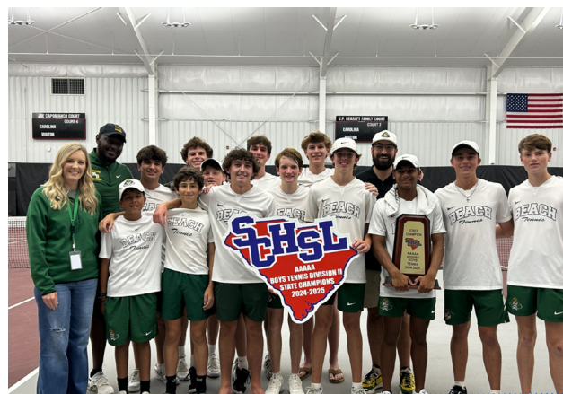
CLASS AAAAA-DIVISION 2 2025 BOYS TENNIS STATE CHAMPIONS