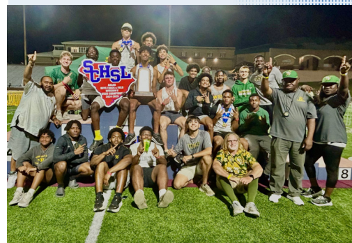
CLASS AAAAA-DIVISION 2 2025 BOYS TRACK AND FIELD STATE CHAMPIONS