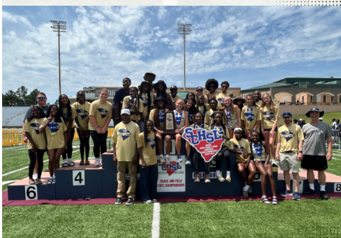
CLASS AAAAA-DIVISION 1 2025 GIRLS TRACK & FIELD STATE CHAMPIONS