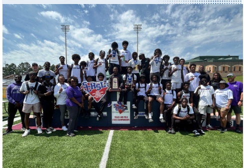
CLASS AAAAA-DIVISION 1 2025 BOYS TRACK AND FIELD STATE CHAMPIONS