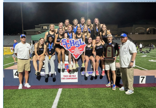
CLASS AAAAA-DIVISION 2 2025 GIRLS TRACK & FIELD STATE CHAMPIONS