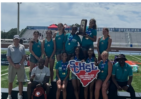
CLASS AAA 2025 GIRLS TRACK & FIELD STATE CHAMPIONS