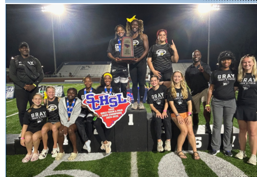
CLASS AAAAA 2025 GIRLS TRACK & FIELD STATE CHAMPIONS