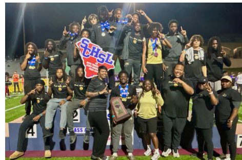
CLASS AA 2025 BOYS TRACK AND FIELD STATE CHAMPIONS