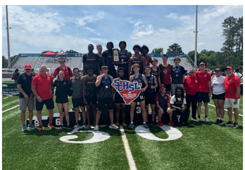
CLASS AAA 2025 BOYS TRACK AND FIELD STATE CHAMPIONS