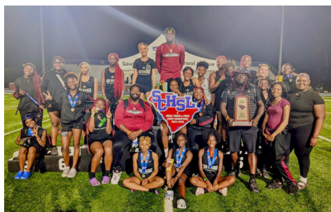
CLASS A 2025 GIRLS TRACK & FIELD STATE CHAMPIONS