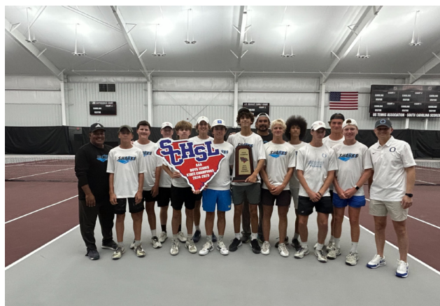
CLASS AAA 2025 BOYS TENNIS STATE CHAMPIONS