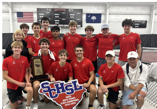
CLASS AAAA 2025 BOYS TENNIS STATE CHAMPIONS