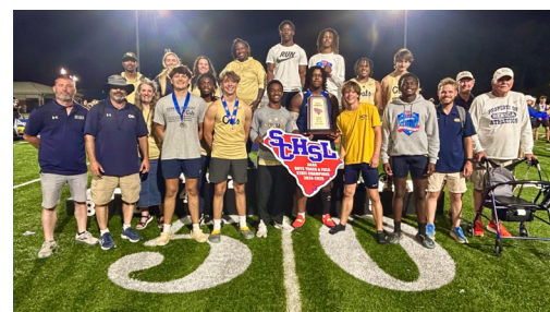
CLASS AAAA 2025 BOYS TRACK AND FIELD STATE CHAMPIONS