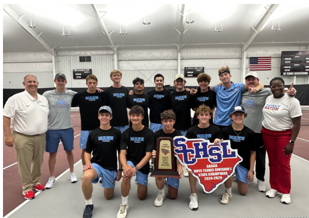
CLASS AAAAA-DIVISION 1 2025 BOYS TENNIS STATE CHAMPIONS