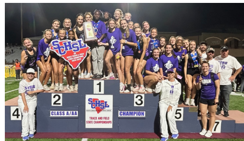
CLASS AA 2025 GIRLS TRACK & FIELD STATE CHAMPIONS