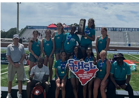
CLASS AAA 2025 GIRLS TRACK & FIELD STATE CHAMPIONS