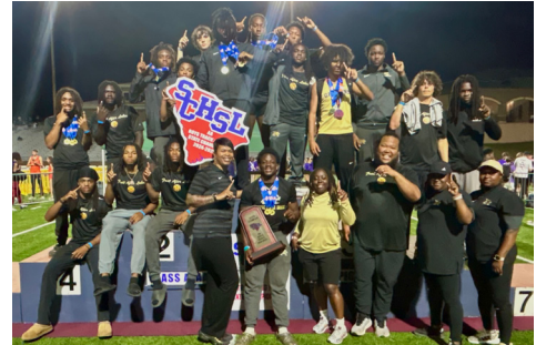
CLASS AA 2025 BOYS TRACK AND FIELD STATE CHAMPIONS