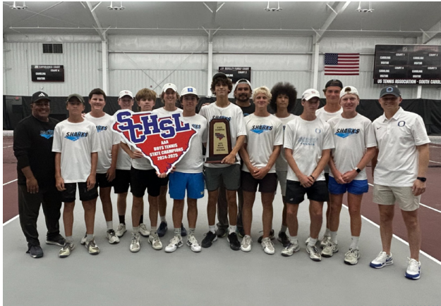
CLASS AAA 2025 BOYS TENNIS STATE CHAMPIONS