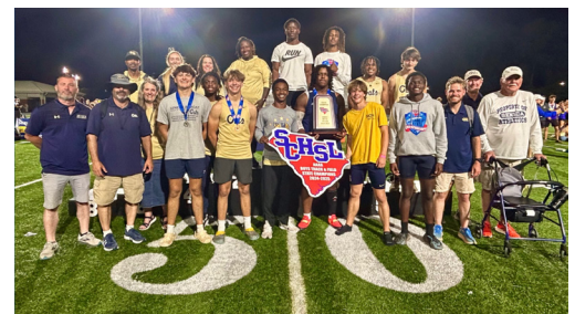
CLASS AAAA 2025 BOYS TRACK AND FIELD STATE CHAMPIONS