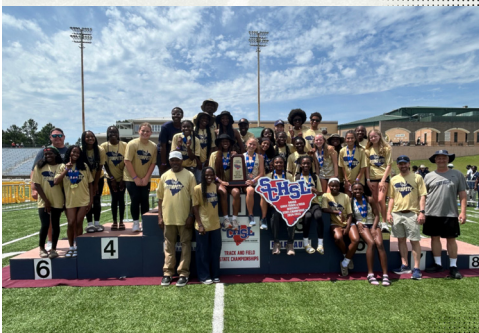
CLASS AAAAA-DIVISION 1 2025 GIRLS TRACK & FIELD STATE CHAMPIONS