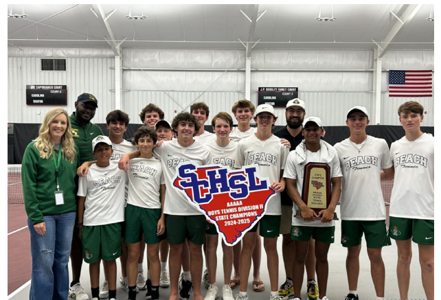
CLASS AAAAA-DIVISION 2 2025 BOYS TENNIS STATE CHAMPIONS