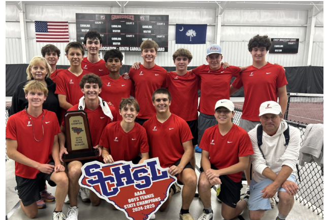
CLASS AAAA 2025 BOYS TENNIS STATE CHAMPIONS