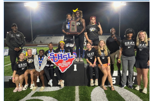
CLASS AAAA 2025 GIRLS TRACK & FIELD STATE CHAMPIONS