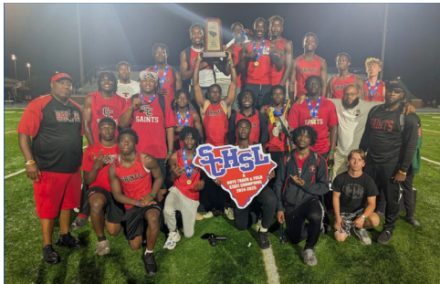
CLASS A 2025 BOYS TRACK AND FIELD STATE CHAMPIONS