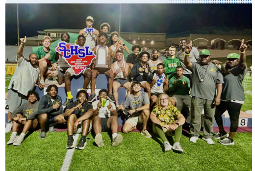
CLASS AAAAA-DIVISION 2 2025 BOYS TRACK AND FIELD STATE CHAMPIONS