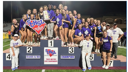
CLASS AA 2025 GIRLS TRACK & FIELD STATE CHAMPIONS