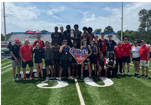
CLASS AAA 2025 BOYS TRACK AND FIELD STATE CHAMPIONS