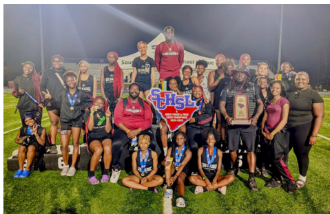
CLASS A 2025 GIRLS TRACK & FIELD STATE CHAMPIONS