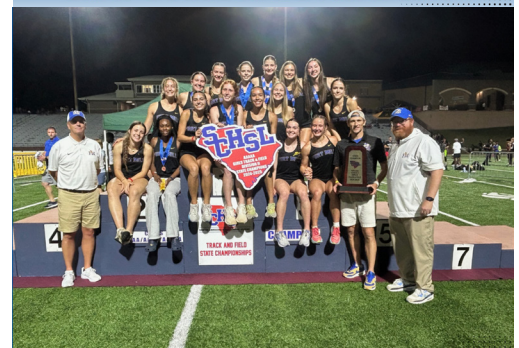
CLASS AAAAA-DIVISION 2 2025 GIRLS TRACK & FIELD STATE CHAMPIONS