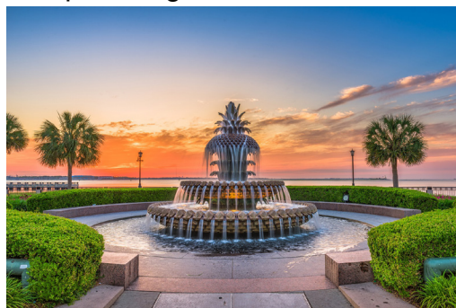
Waterfront Park Fountain