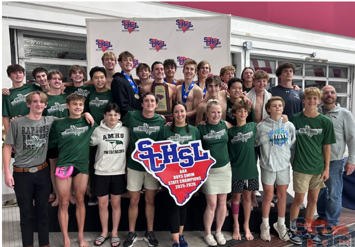
CLASS AAA 2025 BOYS SWIMMING STATE CHAMPIONS ACADEMIC MAGNET HIGH SCHOOL