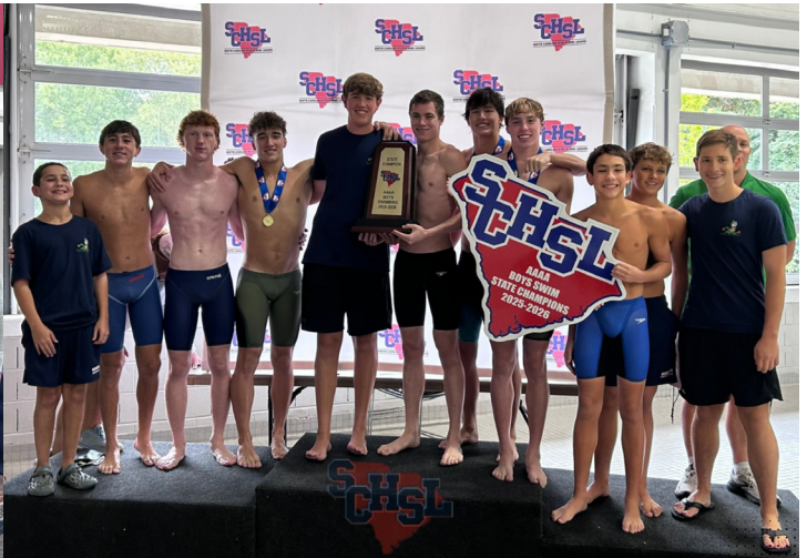
CLASS AAAA 2025 BOYS SWIMMING STATE CHAMPIONS BISHOP ENGLAND HIGH SCHOOL