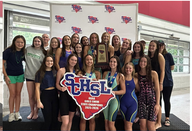
CLASS AAAA 2025 GIRLS SWIMMING STATE CHAMPIONS BISHOP ENGLAND HIGH SCHOOL