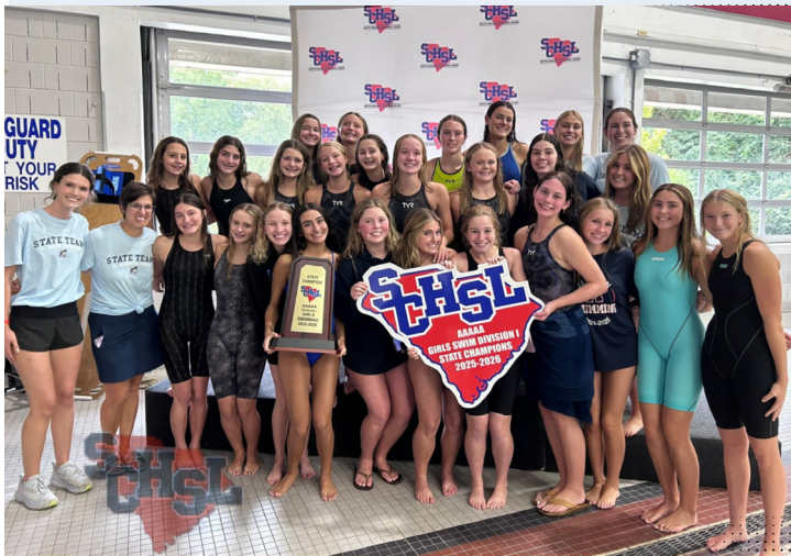
CLASS AAAAA-DIVISION 1 2025 GIRLS SWIMMING STATE CHAMPIONS JL MANN HIGH SCHOOL