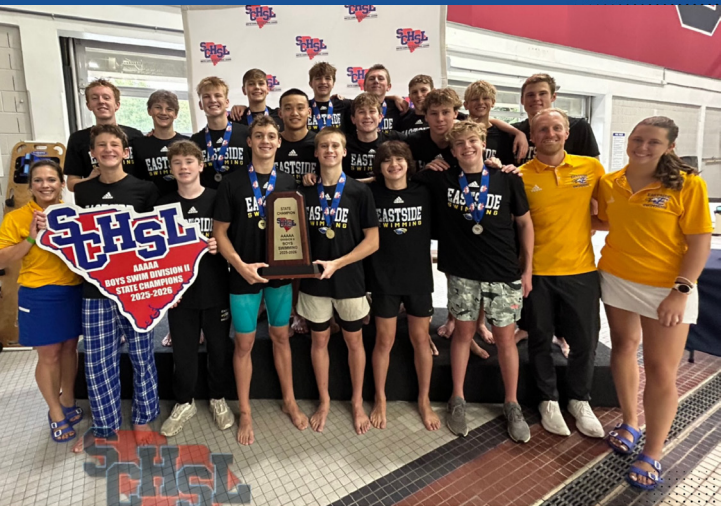
CLASS AAAAA-DIVISION 2 2025 BOYS SWIMMING STATE CHAMPIONS EASTSIDE HIGH SCHOOL