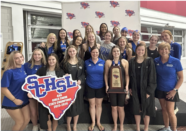
CLASS AAA 2025 GIRLS SWIMMING STATE CHAMPIONS SAINT JOSEPH'S CATHOLIC SCHOOL