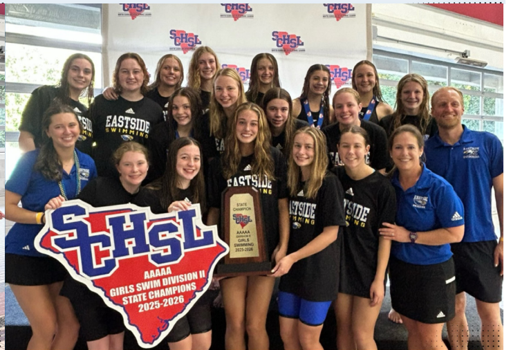
CLASS AAAAA-DIVISION 2 2025 GIRLS SWIMMING STATE CHAMPIONS EASTSIDE HIGH SCHOOL