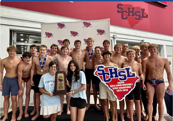
CLASS AAAAA-DIVISION 1 2025 BOYS SWIMMING STATE CHAMPIONS JL MANN HIGH SCHOOL