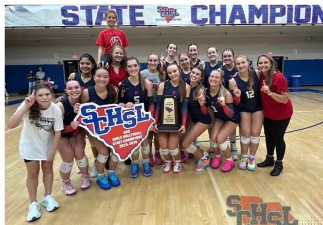
CLASS AAA 2025 GIRLS VOLLEYBALL STATE CHAMPIONS