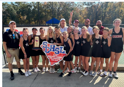
CLASS AAAAA-DIVISION 1 2025 GIRLS TENNIS STATE CHAMPIONS WANDO HIGH SCHOOL