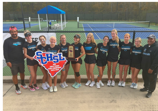
CLASS AAA 2025 GIRLS TENNIS STATE CHAMPIONS OCEANSIDE COLLEGIATE ACADEMY