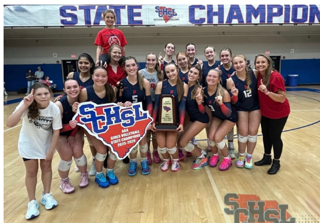
CLASS AAA 2025 GIRLS VOLLEYBALL STATE CHAMPIONS