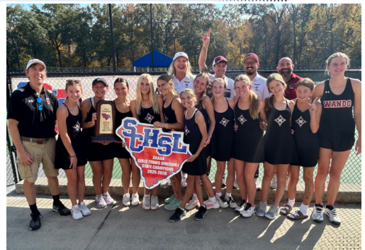
CLASS AAAAA-DIVISION 1 2025 GIRLS TENNIS STATE CHAMPIONS WANDO HIGH SCHOOL