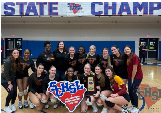
CLASS A 2025 GIRLS VOLLEYBALL STATE CHAMPIONS