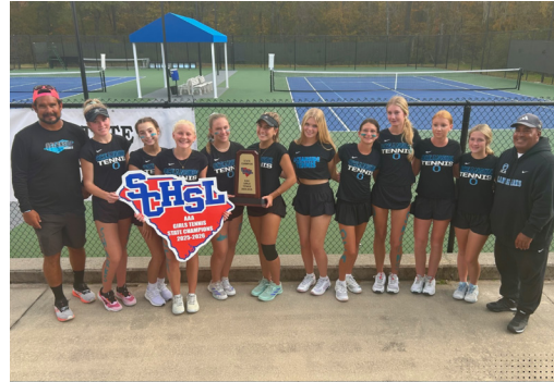
CLASS AAA 2025 GIRLS TENNIS STATE CHAMPIONS OCEANSIDE COLLEGIATE ACADEMY