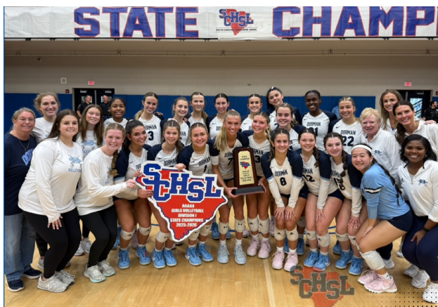
CLASS AAAAA-DIVISION 1 2025 GIRLS VOLLEYBALL STATE CHAMPIONS