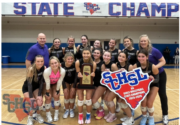
CLASS AA 2025 GIRLS VOLLEYBALL STATE CHAMPIONS