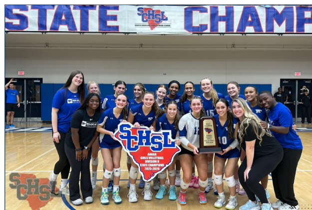
CLASS AAAAA-DIVISION 2 2025 GIRLS VOLLEYBALL STATE CHAMPIONS