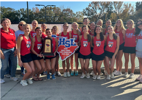
CLASS AAAAA 2025 GIRLS TENNIS STATE CHAMPIONS AC FLORA HIGH SCHOOL