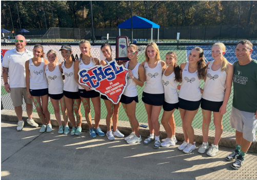
CLASS AA 2025 GIRLS TENNIS STATE CHAMPIONS ACADEMIC MAGNET HIGH SCHOOL