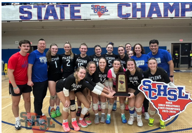
CLASS AAAA 2025 GIRLS VOLLEYBALL STATE CHAMPIONS