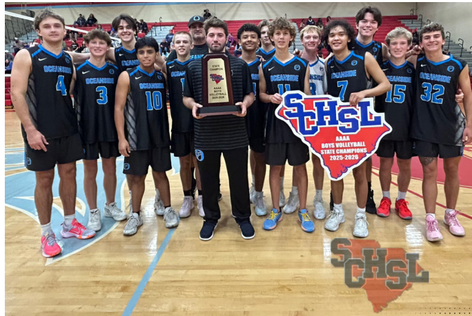
CLASS AAAA 2025 BOYS VOLLEYBALL STATE CHAMPIONS OCEANSIDE COLLEGIATE ACADEMY