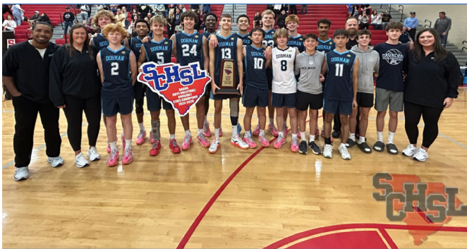
CLASS AAAAA-DIVISION 1 2025 BOYS VOLLEYBALL STATE CHAMPIONS DORMAN HIGH SCHOOL