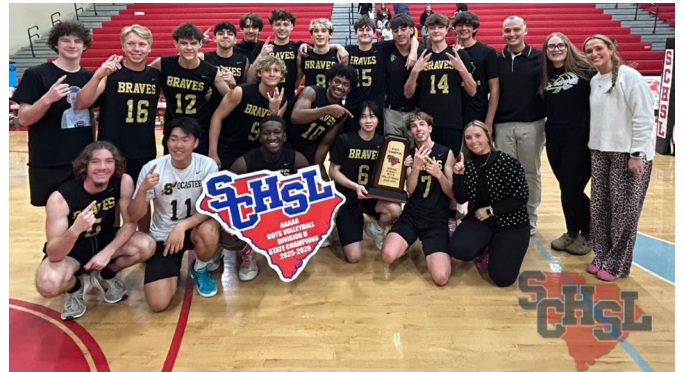
CLASS AAAAA-DIVISION 2 2025 BOYS VOLLEYBALL STATE CHAMPIONS SOCASTEE HIGH SCHOOL