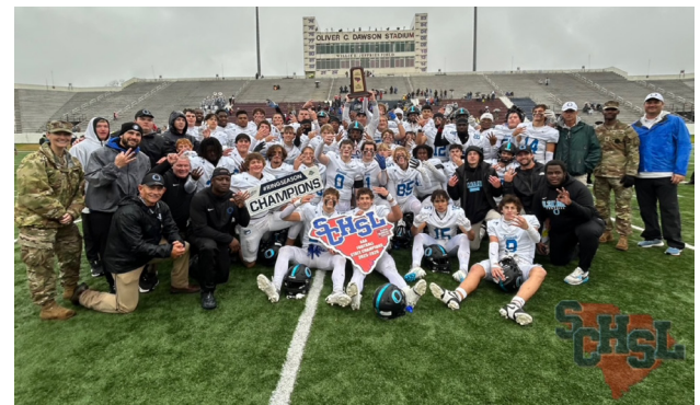
CLASS AAA 2025 FOOTBALL STATE CHAMPIONS OCEANSIDE COLLEGIATE ACADEMY