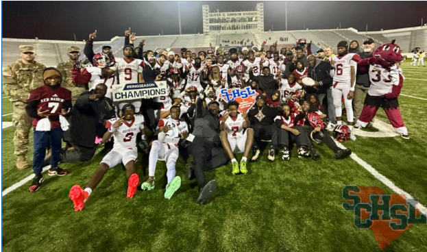
CLASS A 2025 FOOTBALL STATE CHAMPIONS BAMBERG-EHRHARDT HIGH SCHOOL