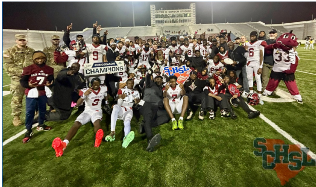
CLASS A 2025 FOOTBALL STATE CHAMPIONS BAMBERG-EHRHARDT HIGH SCHOOL