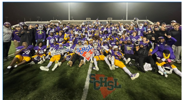
CLASS 5A-DIVISION 2 2025 FOOTBALL STATE CHAMPIONS NORTHWESTERN HIGH SCHOOL