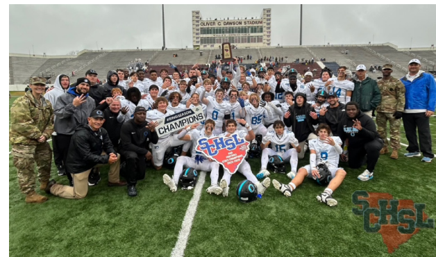
CLASS AAA 2025 FOOTBALL STATE CHAMPIONS OCEANSIDE COLLEGIATE ACADEMY