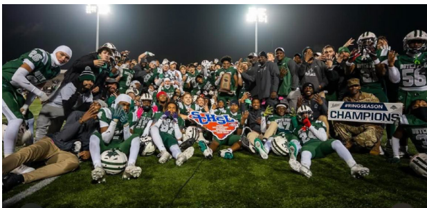
CLASS AAAAA-DIVISION 1 2025 FOOTBALL STATE CHAMPIONS DUTCH FORK HIGH SCHOOL