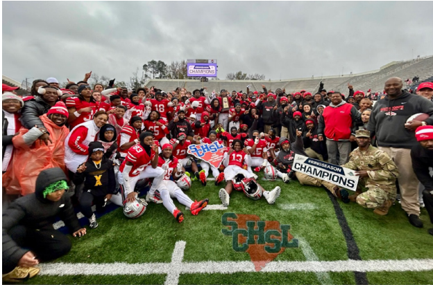
CLASS AAAA 2025 FOOTBALL STATE CHAMPIONS SOUTH POINTE HIGH SCHOOL