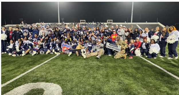
CLASS AA 2025 FOOTBALL STATE CHAMPIONS STROM THURMOND HIGH SCHOOL