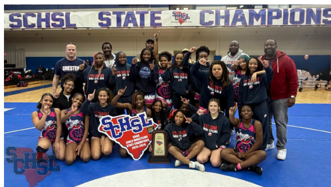
CLASS AAAA INAUGURAL GIRLS WRESTLING STATE CHAMPIONS 2026

At the end of the Duals, Chester was crowned the Inaugural Class 4A Champions and Rock Hill High School repeated as the Class AAAAA State Champion. Rock Hill was the first-ever SCHSL Girls Wrestling Champion (2025).