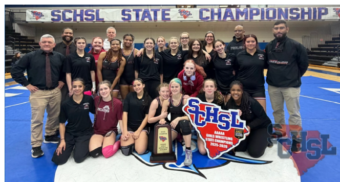
2026 CLASS AAAAA GIRLS WRESTLING STATE CHAMPIONS