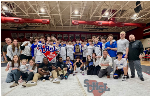
CLASS AAAA 2026 BOYS WRESTLING CHAMPIONS