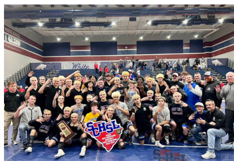
CLASS AAAAA-DIVISION 2 2026 BOYS WRESTLING CHAMPIONS