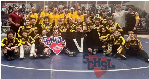
CLASS AA 2026 BOYS WRESTLING CHAMPIONS