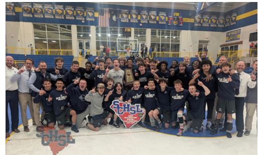
CLASS AAAAA-DIVISION 1 2026 BOYS WRESTLING CHAMPIONS