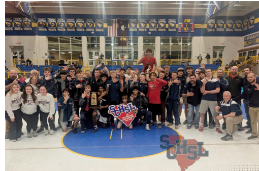
CLASS AAA 2026 BOYS WRESTLING CHAMPIONS